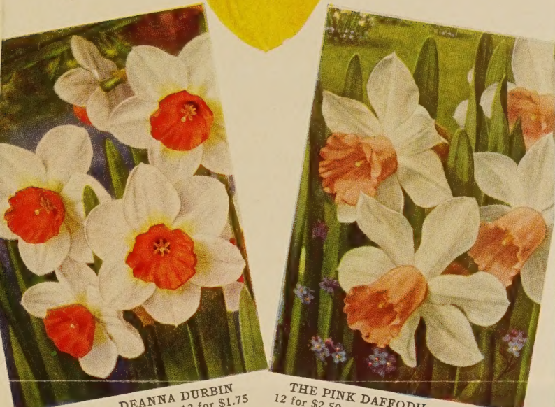
DEANNA DURBIN 12 for $1.75